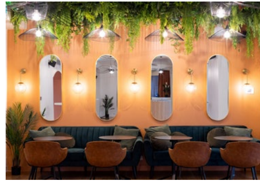
WORKSTATION - PARIS 1 ST An experiential venue that revolutionizes the study day, guaranteeing efficiency and effectiveness