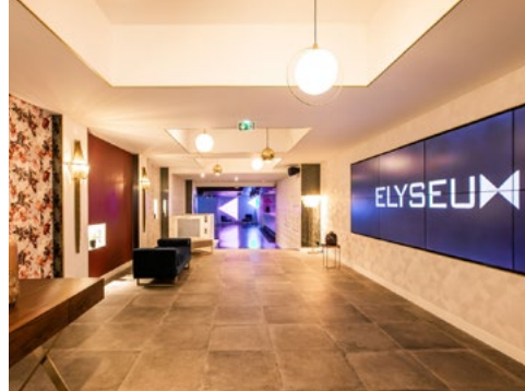
ELYSEUM - PARIS 8 TH 360° wall-mounted videomapping for immersive content delivery