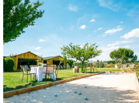
LA CABANE DU GOLF - PARIS 16 TH A country setting combining simplicity and conviviality