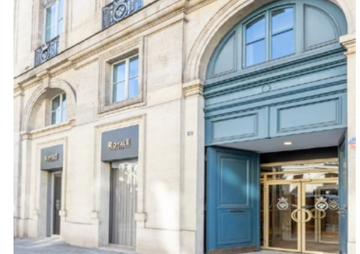
ROYALE - PARIS 8 TH A Parisian private residence for elegant and lively events