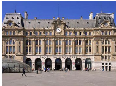
LA COMPAGNIE 1837 - PARIS 8 TH A modern venue set in the heart of the dynamic Saint-Lazare station