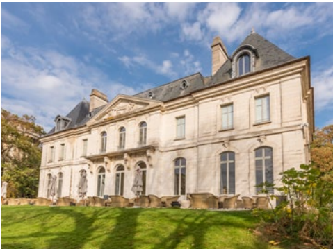
DOMAINE DE LONGCHAMP - PARIS 16 TH A green space in the heart of Bois de Boulogne, in association with the GoodPlanet Foundation