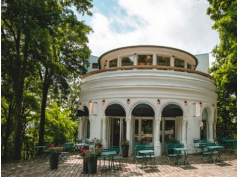
COEUR SACRÉ - PARIS 18 TH Historic and elegant, in the heart of the Montmartre district and at the foot of the Sacré Coeur Basilica