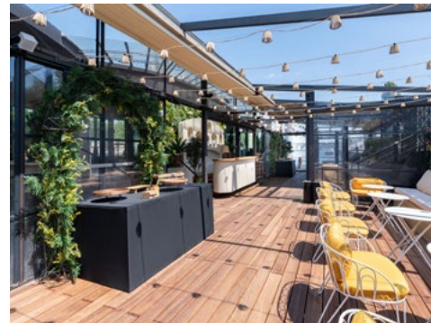
MELBA - PARIS 7 TH A sunny Mediterranean setting with a change of scenery